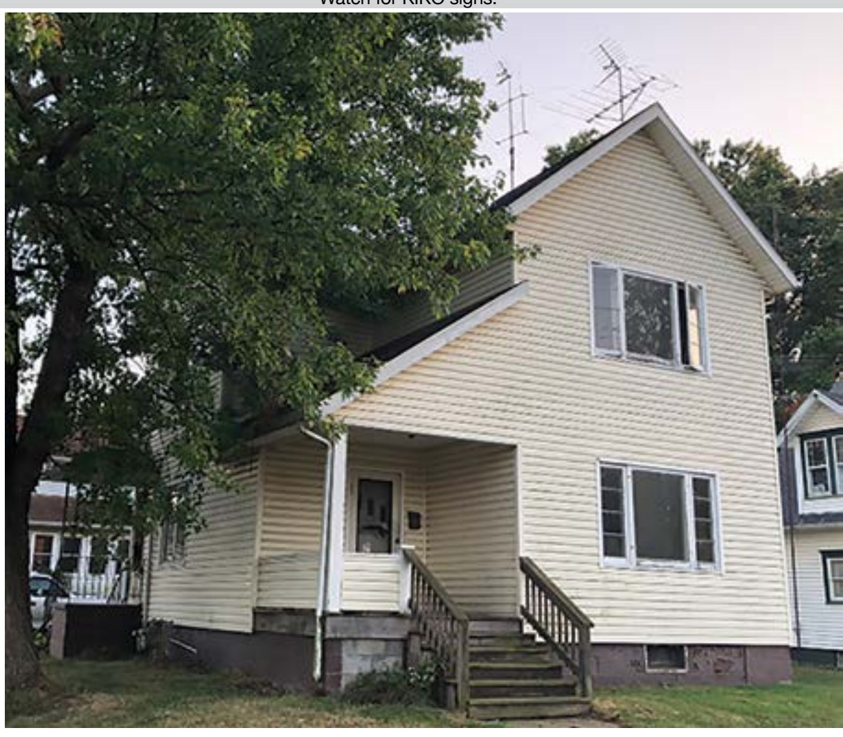
Information is believed to be accurate but not guaranteed.

Directions: Take Union Ave. (Rt. 183) north of State St. to Summit St. and east to S. Mechanic Ave. and north to address. Watch for KIKO signs.